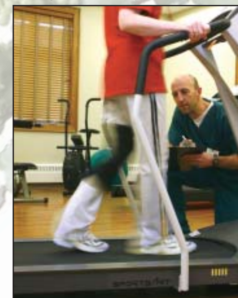
Champion Rehab 320-258-UWIN (8946)

We encourage anyone interested to simply give us a call to set up a tour. We'd love to show you all that we have to offer.